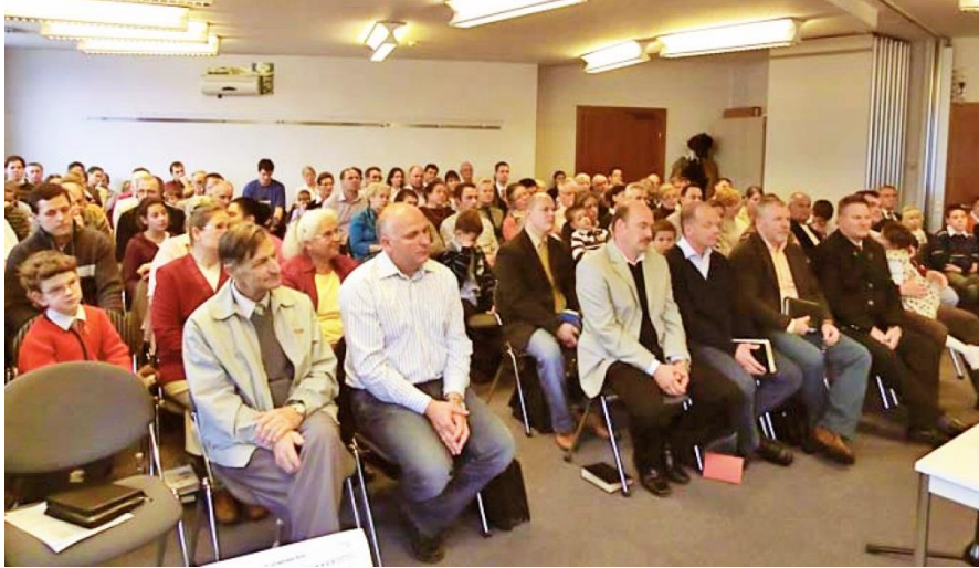
Ishusho y'amateraniri y'i Graz, muri Autrichia