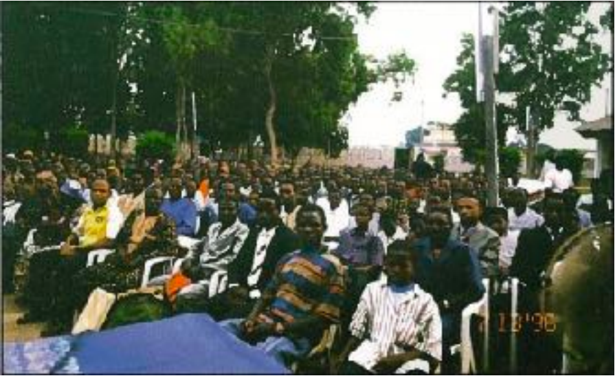
Omutwe gw`abantu omuri Contonou, Benin, Omuri Central Afrika, omu kwa mushanju, 1996