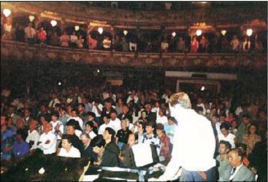
Ahaifo: Rumwe aha nteerane omu ndembo 5 zitari kushushana omuri Romania omu kwa munaana, 1996: iteraaniro eriri kushitamisa abantu 3,000.